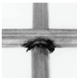
Other traps are zinc galvanized before welding (GBW) - the weld has no zinc, causing premature rusting in seawater

Without you, the marine industry would never have been revolutionized by one of the finest fishing inventions of our time: the wire mesh lobster trap.